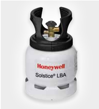
Solstice Liquid Blowing Agent (LBA)